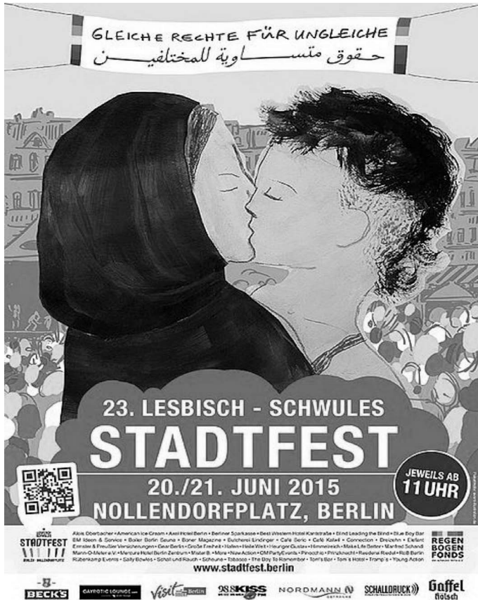
Illustration 1: A poster of the lesbian and gay city festival from the year 2015

“We assume that the Regenbogenfond’s intention, through the putatively more diverse representation of people on the poster, was to reach people and communities who so far were not – or only minimally – represented at the city festival. Had the aforementioned autonomous migrant organizations, groups and associations truly and meaningfully been able to participate in the planning (e.g. of the poster), the city festival might have actually, where possible, gained access to other communities” (MRBB 2015).