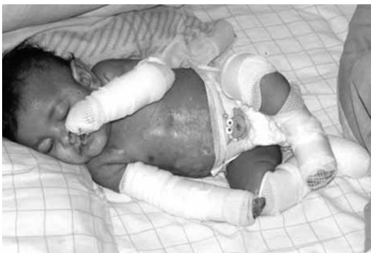
Photograph 4. “Tratamiento epidermolisis bullosa.jpg.”. GNU Free Documentation. License [GFDL ( http://www.gnu.org/copyleft/fdl.html) or CC-BY-SA-3.0-2.5-2.0-1.0 ( http://creativecommons.org/licenses/by-sa/3.0)] Wikimedia Commons.