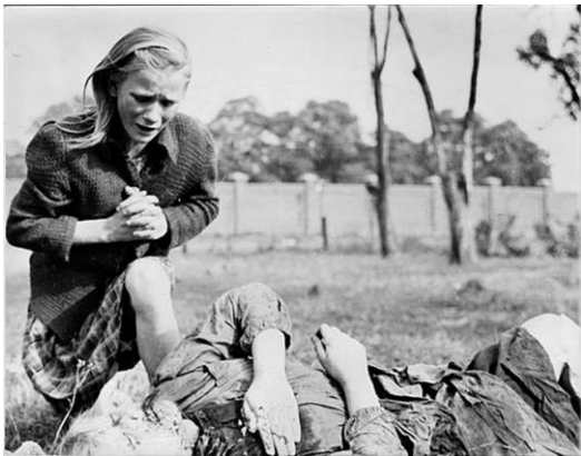
Photograph 1. “Julien Bryan – Life – 50893.jpg.”. Wikimedia Commons.

The Spanish version of PET, PETs, consists of the question, “¿Cuánto considera que esta fotografía le conmueve emocionalmente?”, followed by the options: [1 = nada de emotivo, 2 = un poco, 3 = me produce algunos sentimientos, 4 = bastante emotivo, 5 = mucho]. Below are the images that accompany the above question and response options, please use the source provided to obtain full resolution copies. Please cite the license and author of the photographs when used (for e.g., at the end of the research session).