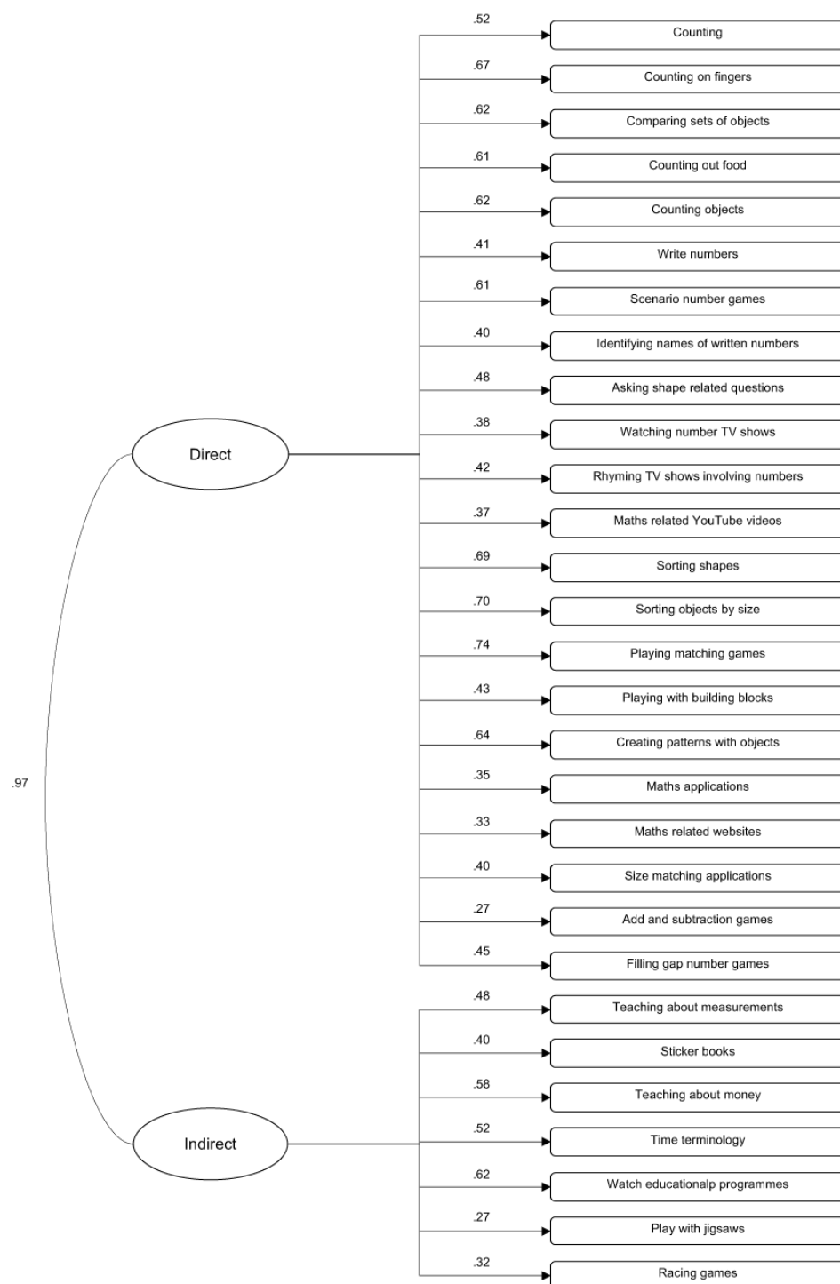
Figure 2. Two-Factor Model Based on the Original Definitions by LeFevre et al. (2009)